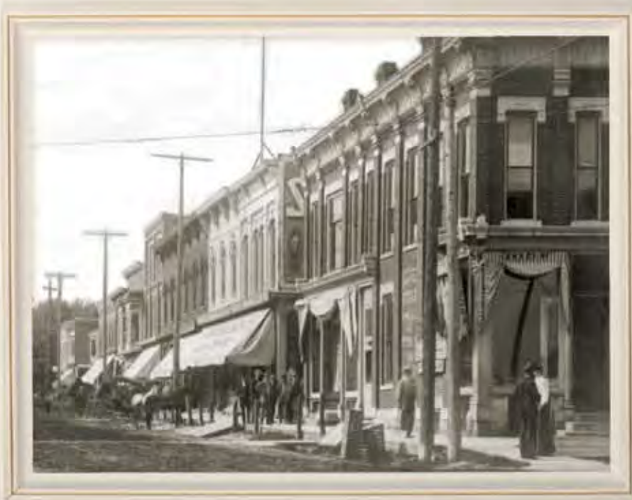
Downtown Chelsea, Early 1900's